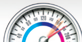
Improved memory bandwidth