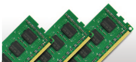
High-speed triple-channel performance